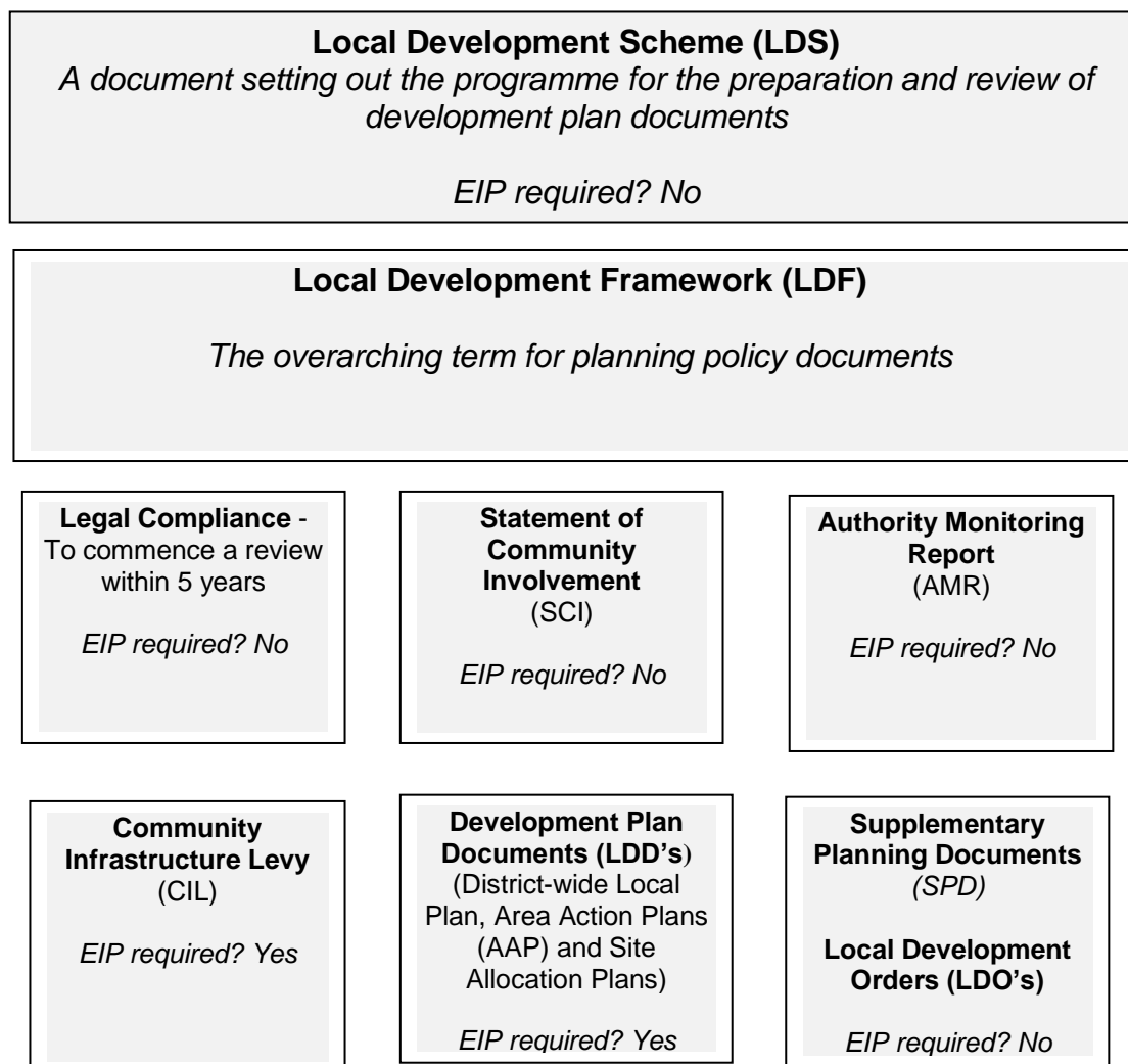
Diagram 2: Relationships between documents within the Local Development Framework